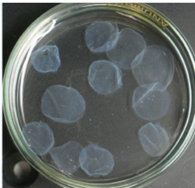
Figure 2. A demonstration of the femtosecond laser's ability to make thin sheets from a cornea [early development: porcine laminar sheets].

TransForm is in its early stages of development, but Dr. Muller expects the product to be on the market, on a limited basis, within about 12 to 18 months in the United States and abroad. The plan is for Allotex to acquire eye-banked corneal tissue and then process it into extremely thin sections so that each cornea can ultimately become multiple inlays [Figures 1-3]. From there, the tissue will be provided to surgeons who use their excimer or femtosecond laser—or a “desktop” excimer laser currently in development by Allotex—to alter the shape to provide the appropriate refractive correction for the patient. Unlike artificial inlays, there is no minimum depth requirement for Transform inlays, and sub-Bowman placement is possible. For onlays, no tissue removal is necessary, and epithelial regrowth has been previously demonstrated to work, according to Dr. Muller.